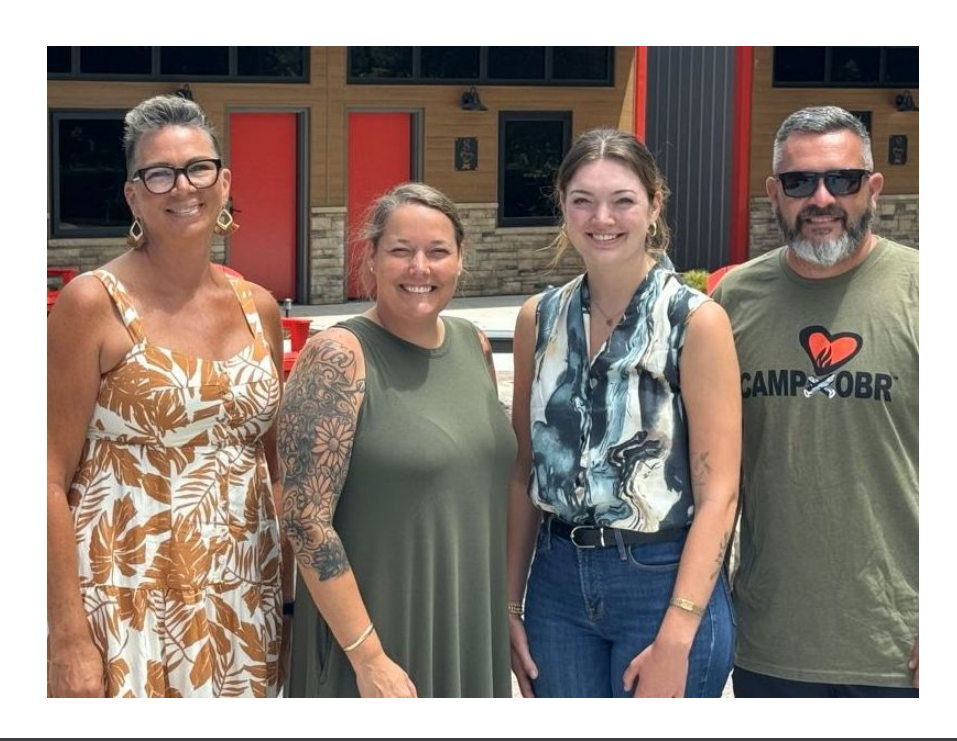
Client Highlights: Fun in Recovery!

Thank you for honoring and supporting our military community in every endeavor, and congratulations on the completion of Camp OBR!